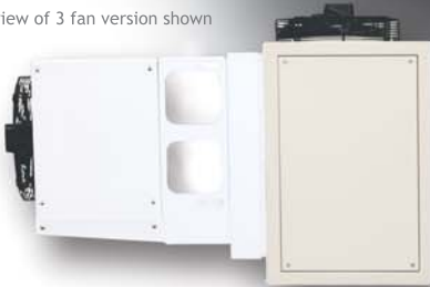
Rear view of 3 fan version shown