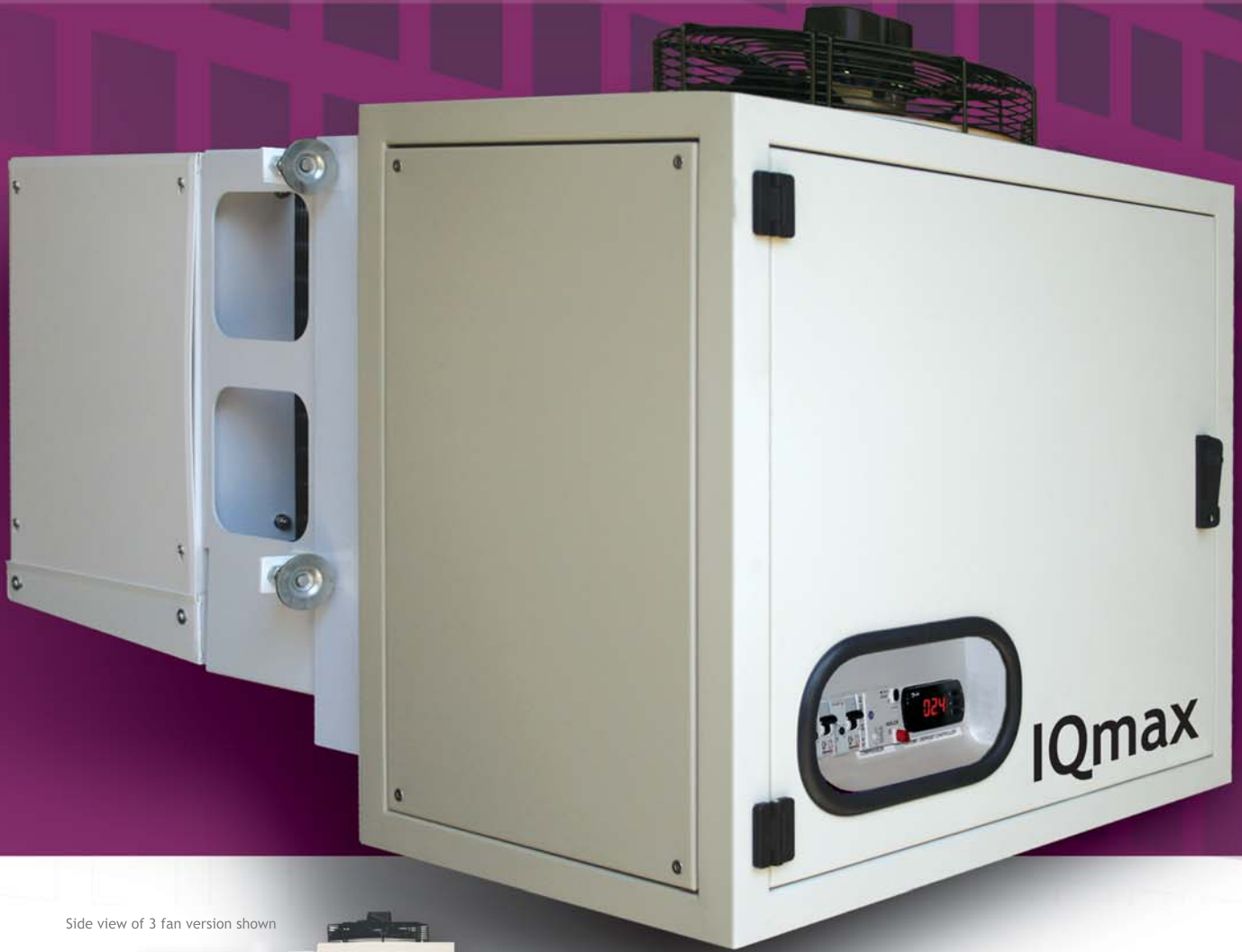
Side view of 3 fan version shown